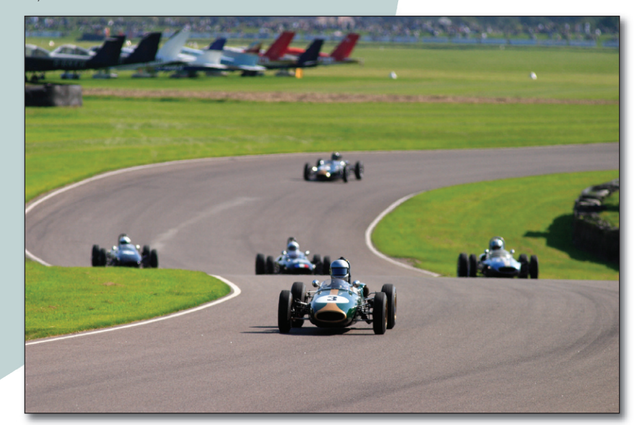
St Mary's is one of the most interesting viewpoints around the track. A series of tractors towing covered trailers act as a bus service right around the circuit, serving this and all the other viewpoints.