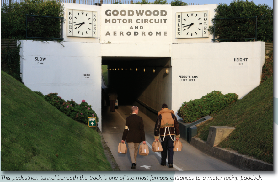
This pedestrian tunnel beneath the track is one of the most famous entrances to a motor racing paddock anywhere in the world.