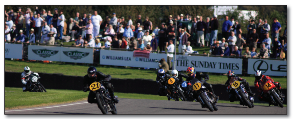
The pack make their way round Madgwick during the first lap of the second Barry Sheene Memorial Trophy race.